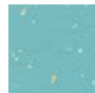
F08 Electric Teal