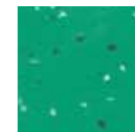
F13 Power Green