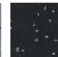
F06 Vibrant Black